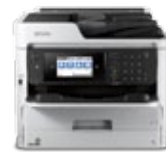
WorkForce Pro WF-C5790 Print/Scan/Copy/Fax