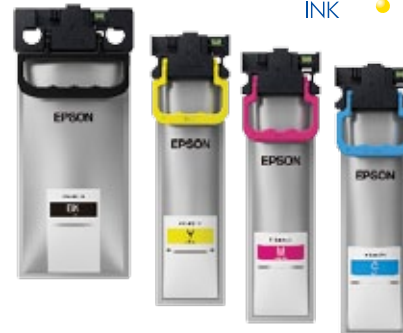
Up to 10,000 pages (Black XL) Up to 5,000 pages (composite yield) (Other colors)

Enjoy greater cost-savings with these high-volume ink packs