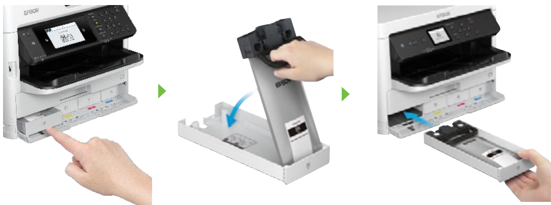
Designed for easy replacement of ink packs

Enjoy greater cost-savings with these high-volume ink packs